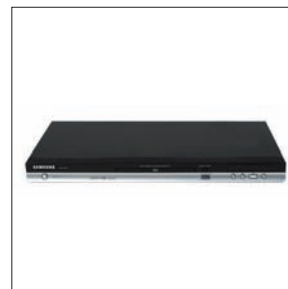
DVD Player EUR 40.00 Cod 025 010 130 030