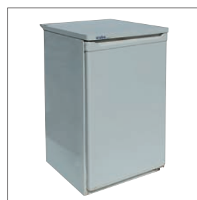
Frigider ARCTIC (180 l) EUR 44.00 Cod 025 010 070 020