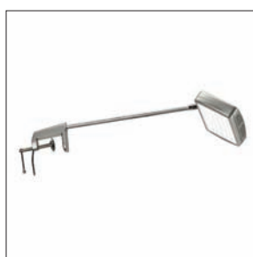
Reflector tija LED A++ 16W 1100LM 4000K ARM33CM EUR 35.00 Cod 019.010.200.040