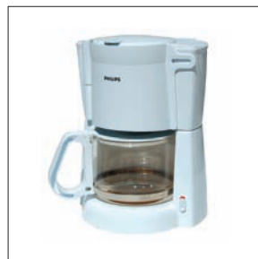
Filtru de cafea EUR 4.00 Cod 025.010.120.010