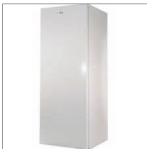
Frigider ARCTIC 255 l EUR 55.00 Cod 025 010 020 199