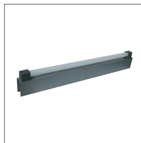
Corp fluorescent tip SS30 EUR 15.00 cu un tub D-170 Cod 019.010.190.000