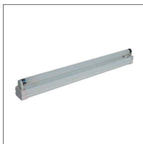
Corp fluorescent tip SS30 EUR 18.00 cu un tub D-170 - A Cod 019.010.190.001