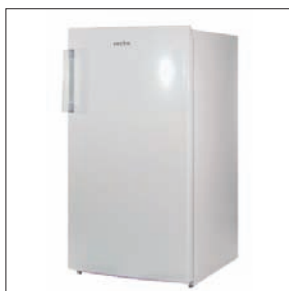
Frigider ARCTIC FB 155 EUR 25.00 Cod 025 010 020 198