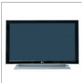
TV Plasma EUR 25.00/zi (diagonala ecran: 107 cm) Cod 025 010 130 040