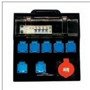
Panou Electric 380V/220V EUR 100.00 Cod 019.010.265.000