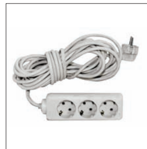
Prelungitor 230V, 10A, 5m EUR 10.00 Cod 019.010.279.000