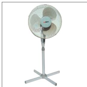
Ventilator cu picior EUR 7.00 Cod 025.010.500.020