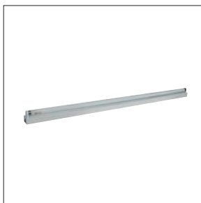
Lampa fluorescenta FIA EUR 15.00 cu instalatie electrica completa 1x40W Cod 019.010.110.000