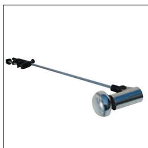
Lampa spot cu brat EUR 12.00 Cod 019.010.180.000