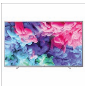
TV LED SMART 4K, EUR 40.00/zi UHD ultrasubtire (diagonala ecran: 126 cm) Cod 025 010 130 045