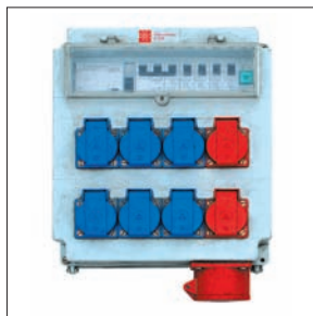
Panou Electric EUR 120.00 OCTANORM Cod 019.010.275.000