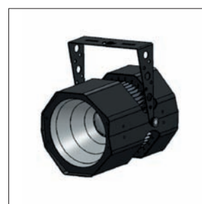
Reflector LED VIRGO 40W 4350 LM 4100 K EUR 40.00 Cod 019.010.200.045