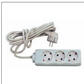
Prelungitor 230V, 10A, 3m EUR 10.00 Cod 019.010.277.000