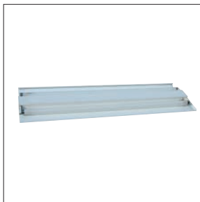
Corp fluorescent tip EUR 20.00 OCTANORM cu doua tuburi D-171 Cod 019.010.200.000