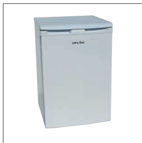
Racitor (140 l) EUR 24.00 Cod 025 010 070 010 (55 x 61 x 84 cm)