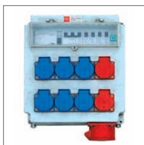
Panou Electric OCTANORM Cod 019.010.275.000