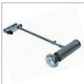
Lampa spot cu brat 100W EUR 12.00 Cod 019.010.181.000