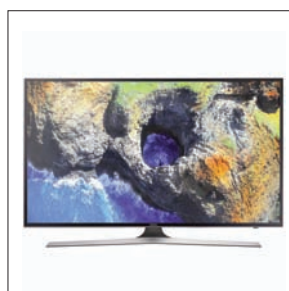
TV SAMSUNG UHD, (diagonala ecran: 163 cm) Cod 025 010 130 047