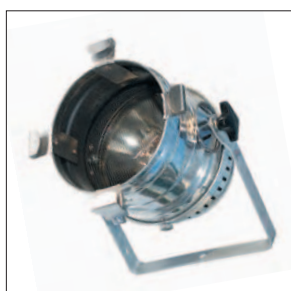
Reflector PAR64 500-1000W EUR 40.00 Cod 019.010.200.020