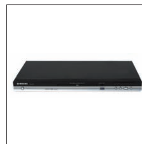
DVD Player Cod 025 010 130 030