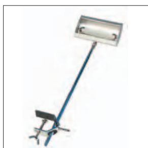
Reflector cu brat 300W EUR 35.00 Cod 019.010.200.010