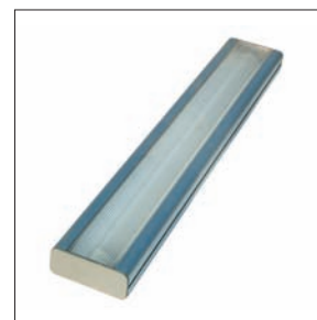
Corp fluorescent tip SYMA STAR Cod 019.010.200.001