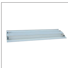
Corp fluorescent tip OCTANORM cu doua tuburi D-171 Cod 019.010.200.000