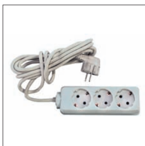
Prelungitor 230V, 10A, 3m Cod 019.010.277.000