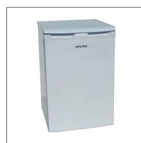
Racitor (140 l) Cod 025 010 070 010 (55 x 61 x 84 cm)