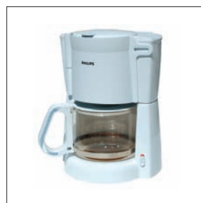
Filtru de cafea Cod 025.010.120.010