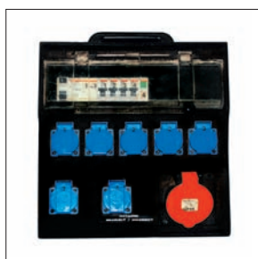
Panou Electric 380V/220V Cod 019.010.265.000