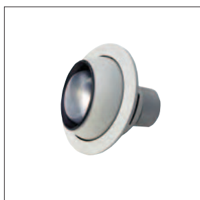
Lampa spot 100W EUR 12.00 Cod 019.010.170.000