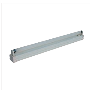
Corp fluorescent tip SS30 cu un tub D-170 - A Cod 019.010.190.001