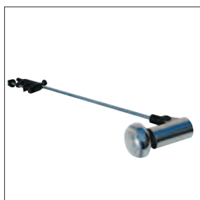
Lampa spot cu brat EUR 12.00 Cod 019.010.180.000