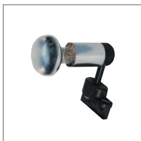
Lampa spot 100W EUR 12.00 Cod 019.010.188.000