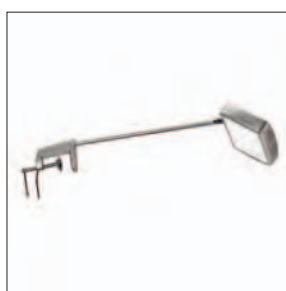
Reflector tija LED A++ 16W 1100LM 4000K ARM33CM EUR 35.00 Cod 019.010.200.040