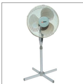
Ventilator cu picior Cod 025.010.500.020