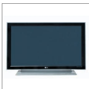
TV Plasma (diagonala ecran: 107 cm) Cod 025 010 130 040