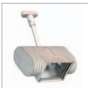
Reflector halogen SYMA STAR 300W EUR 35.00 Cod 019.010.200.006