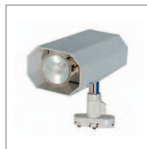
Spot halogen SY STAR 50W(A) EUR 15.00 Cod 019.010.186.000