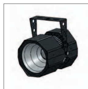
Reflector LED VIRGO 40W 4350 LM 4100 K EUR 40.00 Cod 019.010.200.045