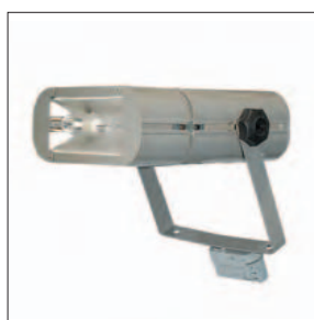
Reflector IVEN HQI 150W EUR 35.00 Cod 019.010.200.005