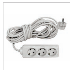
Prelungitor 230V, 10A, 5m Cod 019.010.279.000