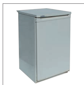
Frigider ARCTIC (180 l) Cod 025 010 070 020