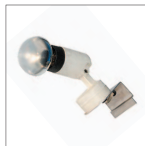
Lampa spot SS30 100W EUR 12.00 Cod 019.010.200.008