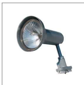
Spot halogen SY STAR 100W EUR 15.00 Cod 019.010.185.000