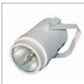
Reflector HQI 80W EUR 35.00 Cod 019.010.200.030