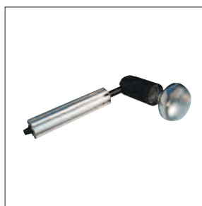
Lampa spot stut OCTANORM EUR 12.00 Cod 019.010.187.000