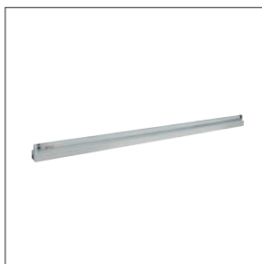
Lampa fluorescenta FIA cu instalatie electrica completa 1x40W Cod 019.010.110.000