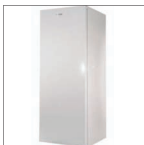
Frigider ARCTIC 255 l Cod 025 010 020 199