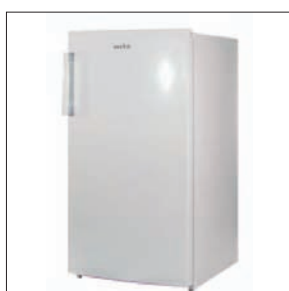
Frigider ARCTIC FB 155 Cod 025 010 020 198