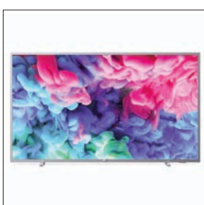
TV LED SMART 4K, UHD ultrasubtire (diagonala ecran: 126 cm) Cod 025 010 130 045